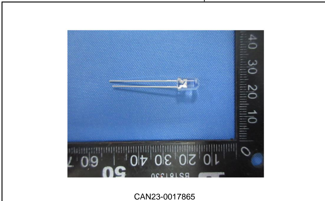
Photo of Submitted Sample

SGS authenticate the photo on original report only